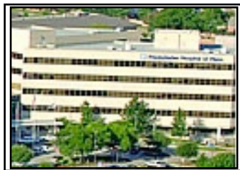
Texas Health Presbyterian Plano