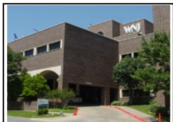
Texas Health Presbyterian-WNJ Sherman