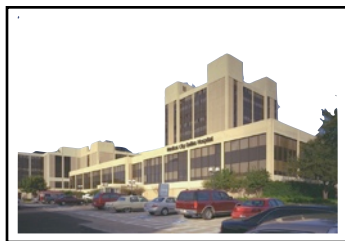
Medical City Dallas Hospital

“It’s Great to be Alive... and to Help Others”