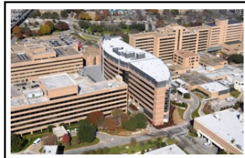
Texas Health Presbyterian Hospital Dallas